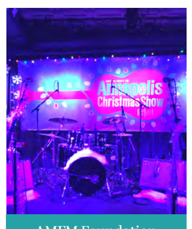
AMFM Foundation FOUNDATIONS OF THE YEAR